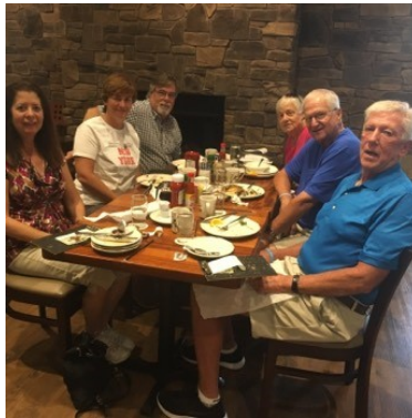
Small gathering but good conversation