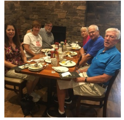
Small gathering but good conversation, Kit took the photo.