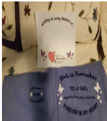
T-Shirt & Bib