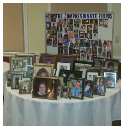
Gallery of Remembrance