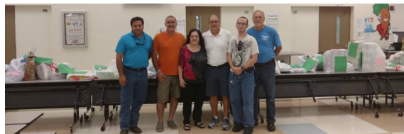
Gift Distribution at Village Oaks School